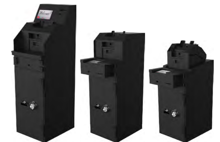
KUAN KUANLite with Cover KUANLite